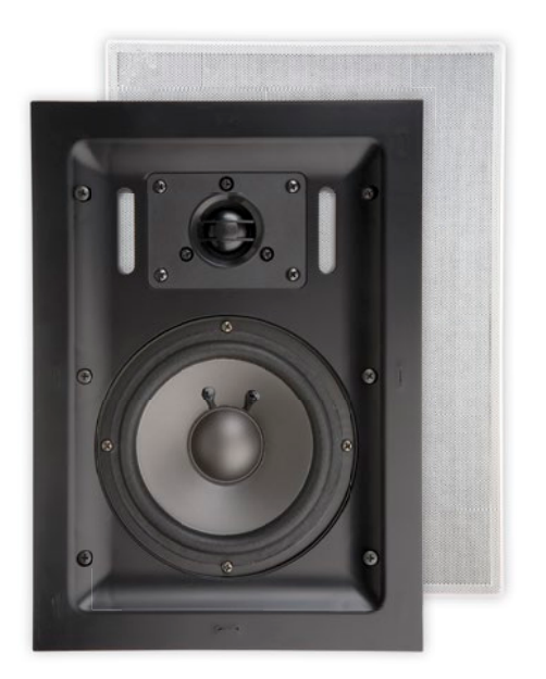
black grill (option)