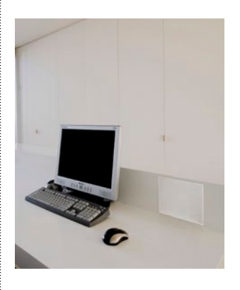
The FL301 is not only discreet, it's also versatile. Here it's incorporated into a desk.

This inwall loudspeaker is flatter and even less visible than all its predecessors. The frame was reduced to just 1 millimeter, yet continues to score high in terms of vibration absorption. The loudspeaker's grill has also been noticeably fine-tuned and almost feels like silk to the touch. The sound is accurate, warm and carries far. A no-bones-about-it speaker.